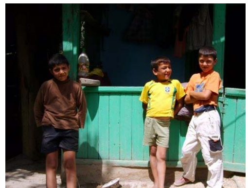
Children in Dumitresti