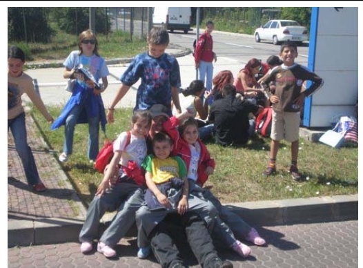
Children waiting for aircraft to return home after a vacation in Belgium