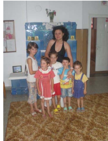
Children's shelter in Dumbraveni

Casa di Copii invites these children to the homes of voluntary Belgian families military and others for 2 weeks at Christmas and/or 6 weeks during the Summer where they are surrounded with the necessary structure, stability and care they lack in Romania and where they are provided with the healthcare they can't be given by the Social Services of Romania such as dental care.